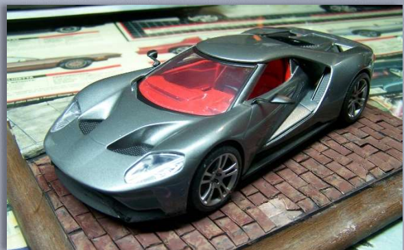
2 of Dave's recent builds